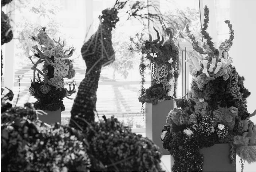
Figure 1. Institute For Figuring's Crochet Coral Reef project, 2005–ongoing, as installed at New York University Abu Dhabi Institute, 2014.

intellect and physicality. In its exhibitions, workshops, lectures, and artist residencies, the IFF seeks to animate abstract ideas like geometry, engineering, topology, physics, and biological life, and does so by making public and accessible exercises of material play, things like how to cut and fold paper, crochet yarn, and tie rope knots. At workshops and installations of the Crochet Coral Reef the techniques of hyperbolic crochet (a way to fabricate ruffles and squiggles by increasing stitches on a traditional crochet foundation chain) are taught alongside ideas of hyperbolic space and activist interventions in plastic waste and the crisis of climate change. In this process, making things with the hands intervenes in hierarchies of sensory knowledge to value the work of sensation and touch and make a potentially difficult idea tactile and intimate. Figuring a calculation is a labor shared by our motor, optic, and cognitive capacities. In crochet and handicraft, figuring yields a felt dimensionality and augments our limited ability to know a thing as impossible and imaginary as hyperbolic space. Reef makers take yarn and repurposed plastic trash in a hopeful occupation of a different perspective, abundant, infinite, and spiraling outward, proliferating an excess of surfaces, points of parallel, curvature, and intersecting lines.