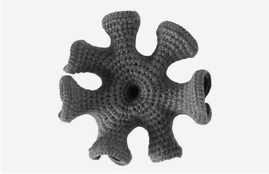
Figure 2. Institute For Figuring's Crochet Coral Reef project, 2005–ongoing. Hyperbolic model by Margaret Wertheim.

ing identity, the dimensional field of hyperbolic space provides another method to measure the relation between bodies and objects differently, to resist the limited and oppositional categories of surface and depth that locate transgender either on or inside the body. We might foreground, for example, gender transformation as a process of assembly and disassembly in which bodies auto-engineer shape and form, building and remaking connections between the soft and pliable material forms of emotional and material life. An alignment of lines in infinite intersection, transgender is a shape and, in the conjoining of feelings beside fractals, an alternative dimension of shapes—of negative (hyperbolic) and positive (Euclidean) curvature—can coexist to proliferate an abundance of shapely possibilities